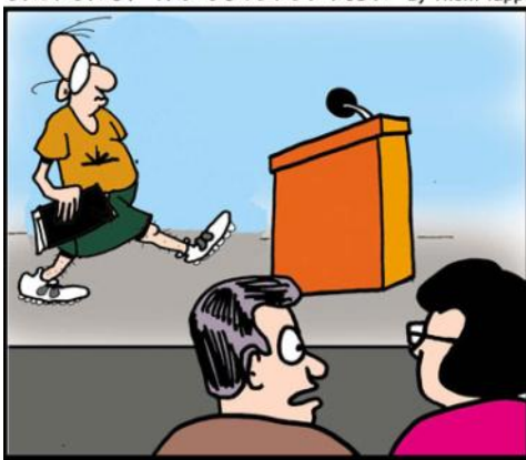
CHURCH OF THE COVERED DISH by Thom Tapp

"I miss the good old days when pastors wore suits and ties."