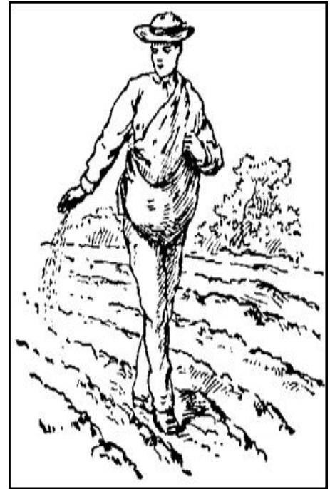
Ecclesiastes 11:4 Whoever watches the wind will not plant;

If we plant God’s Word in our hearts, the harvest we reap is eternal life. Let’s heed the warnings and the promised blessings. We should expect to share in the crop at the harvest because of our labors.